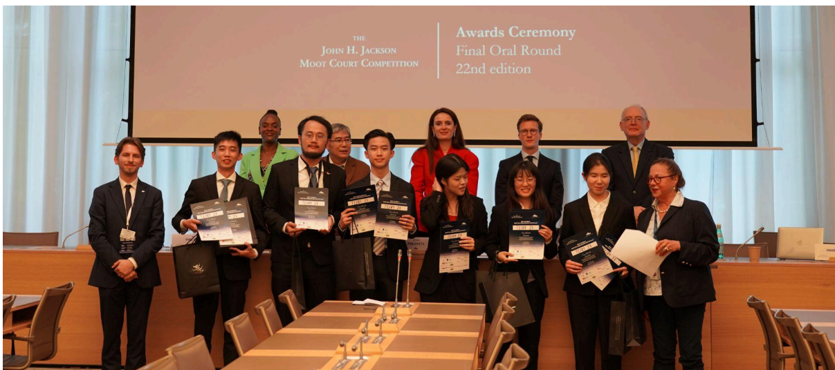
Team 27 from National Taiwan University (Chinese Taipei) - winner of the prize for the Best Respondent Written Submission (the Valerie Hughes Award) and Best Overall Written Submission.