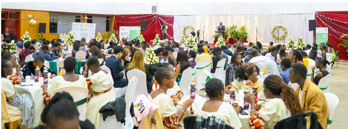
The Participants, Organising Committee members, invited guests, representatives of ELSA International and WTO during the Closing Ceremony.