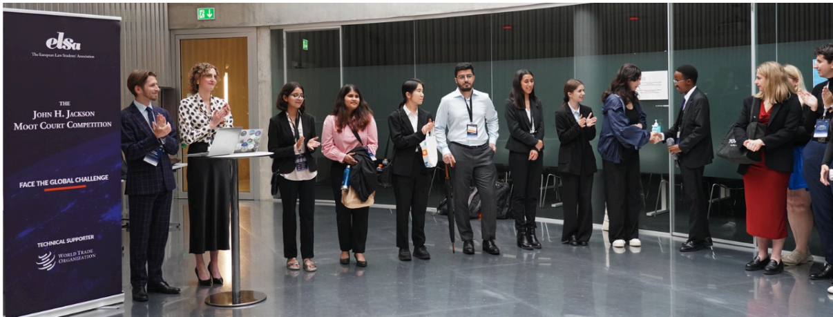
The announcement of the Quarter-Finalists

Additionally, on the third day (20 th of June), having obtained both the scores from the Written Submissions and the teams' scores from the Preliminary Rounds, the 8 teams qualifying for the Quarter-Finalists were announced at the Geneva Graduate Institute.