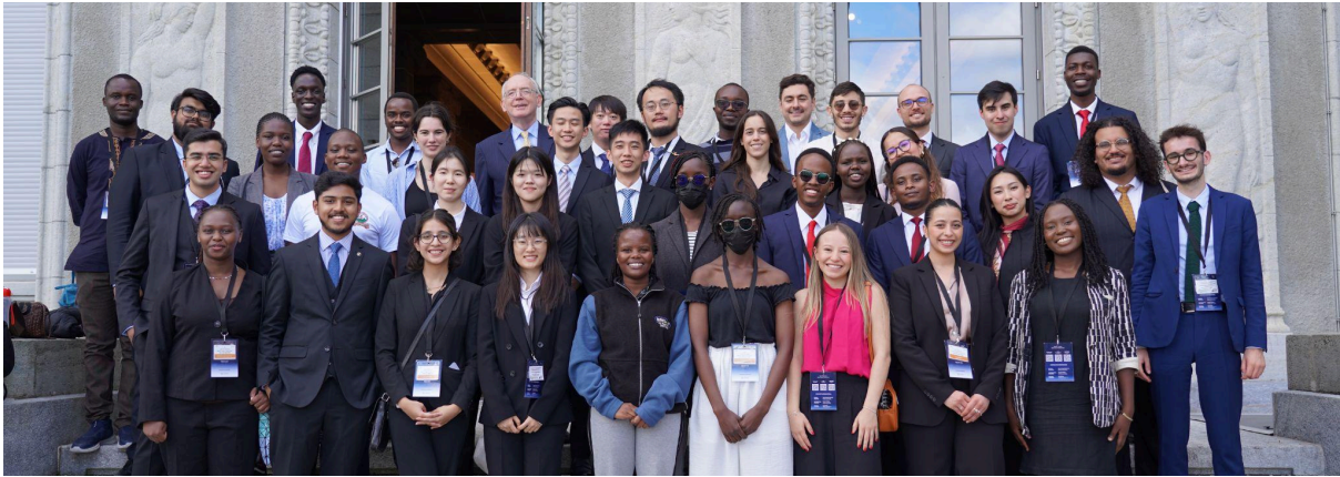
Group picture of the Participants, Panellists and Supporters of the Competition

In the evening, the Final Oral Round of the 22 nd John H. Jackson Moot Court Competition concluded with the Closing Dinner where all participants and invitees could enjoy a three course dinner at Brasserie des Halles de l'Île.