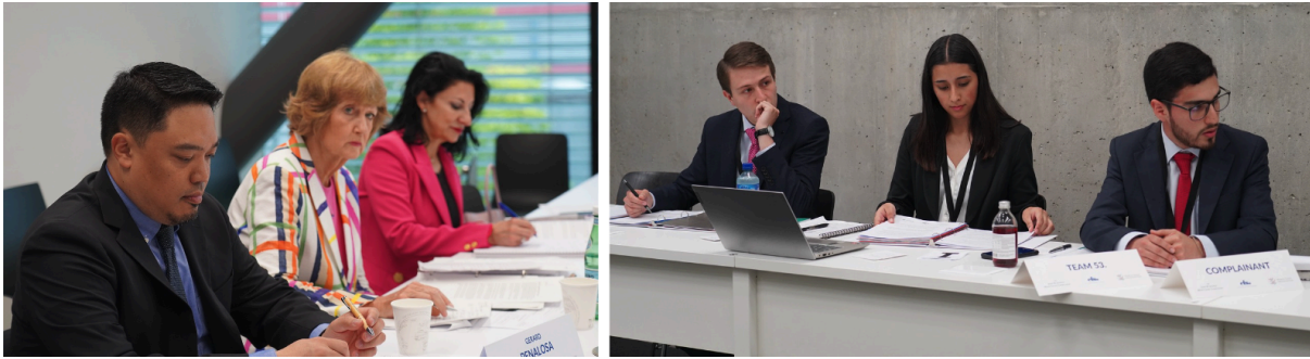
Panellists, Participants, Timekeepers during the Preliminary Pleadings

Additionally, on the third day (20 th of June), having obtained both the scores from the Written Submissions and the teams' scores from the Preliminary Rounds, the 8 teams qualifying for the Quarter-Finalists were announced at the Geneva Graduate Institute.