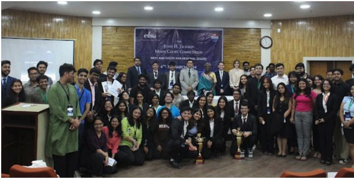
The Organising Committee members of the West & South Asia Regional Round with Participants, Representatives of ELSA International and Panellists.