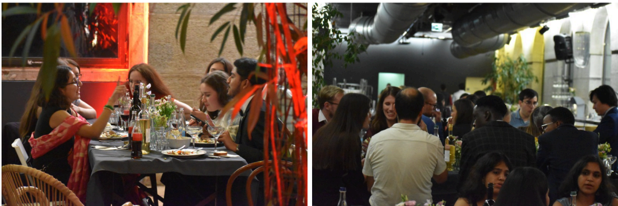
The Participants, Supporters and Organising Committee during the Closing Diner of the Final Oral Round

In the evening, the Final Oral Round of the 22 nd John H. Jackson Moot Court Competition concluded with the Closing Dinner where all participants and invitees could enjoy a three course dinner at Brasserie des Halles de l'Île.