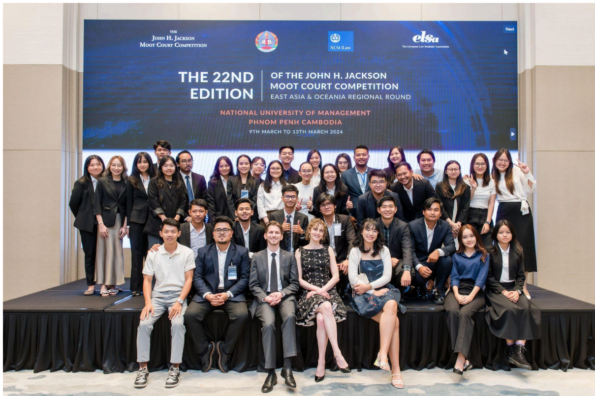
The Organising Committee members of the East Asia & Oceania Regional Round with Representatives of ELSA International.