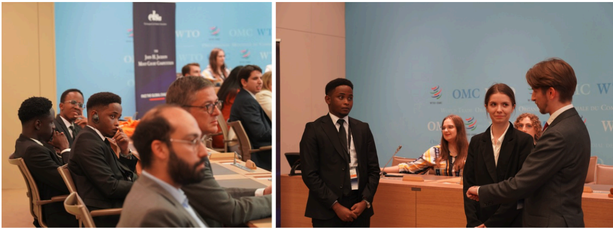
On the left: Teams, Panellists and the Organising Committee during the announcement of the Grand Finalists, on the right - representatives of Team 1 and Team 97 during the coin toss.

After the Semi-Finals and the calculation of scores, the Teams, Panellists joined together to spectate the announcement of the Grand Finalists.