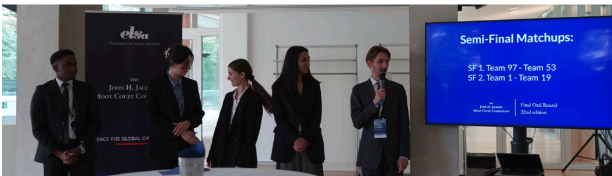
Announcement of the Semi-Finalists and Semi-Final Matchups

After the conclusion of the Sponsors' Fair the teams qualifying for the Semi-Finals were announced. The afternoon continued with the Semi-Finals and was concluded with the announcement of the Grand Finalists who were to compete the next day.