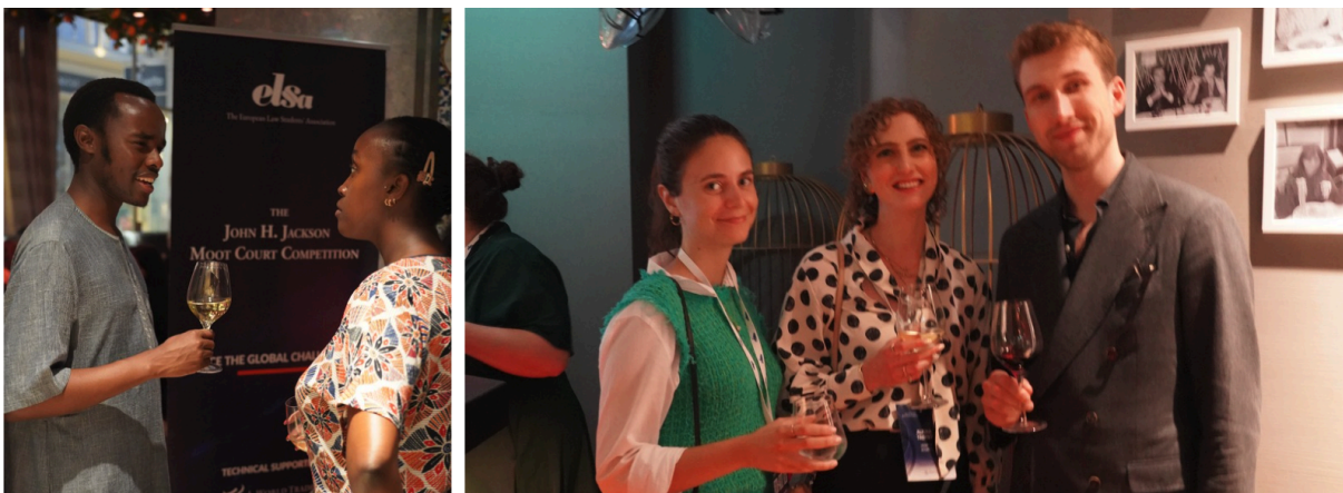
Participants and the Organising Committee during the Alumni Get-together.

After the conclusion of the Quarter-Finalists Announcement the Participants, Partners and Panellists were invited to the first ever Alumni Get-together, which presented a chance to network in a more informal setting.