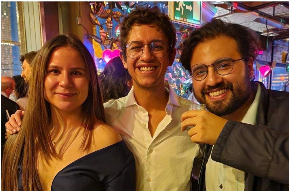
Some Organising Committee members of the All-American Regional Round.

Written by the Organising Committee of the All-American Regional Round in Bogotá, Colombia