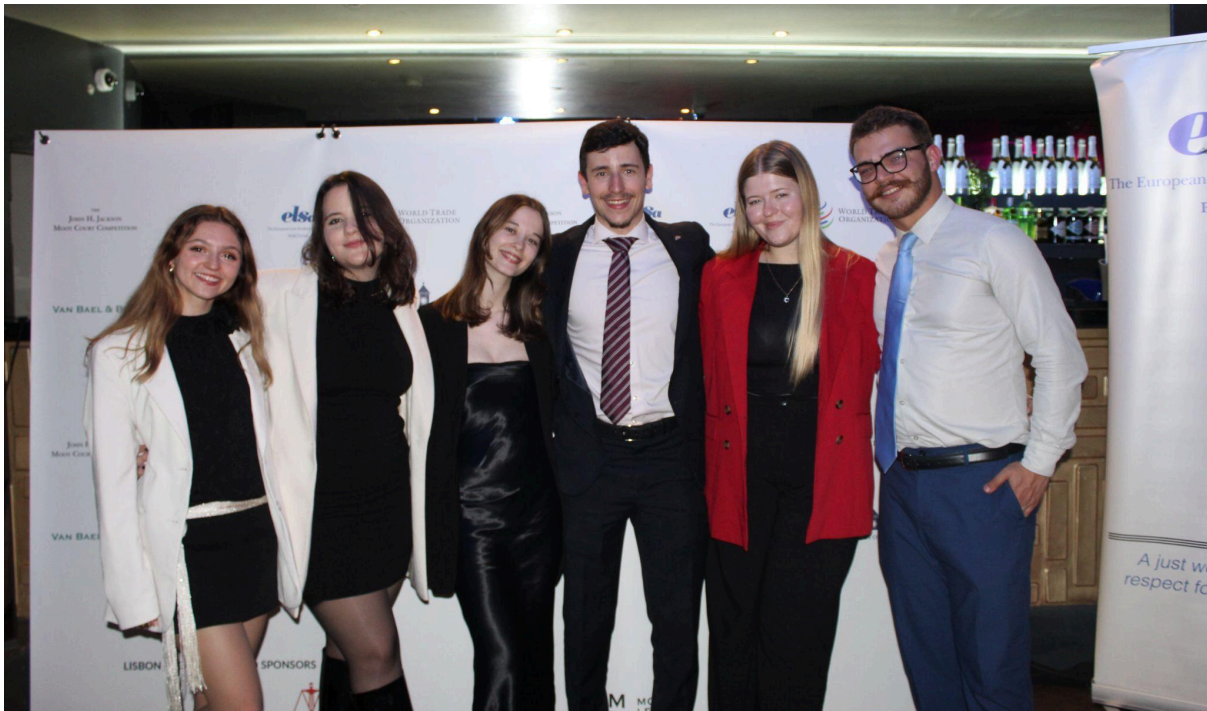
Some of the Organising Committee members of the 2nd European Regional Round.