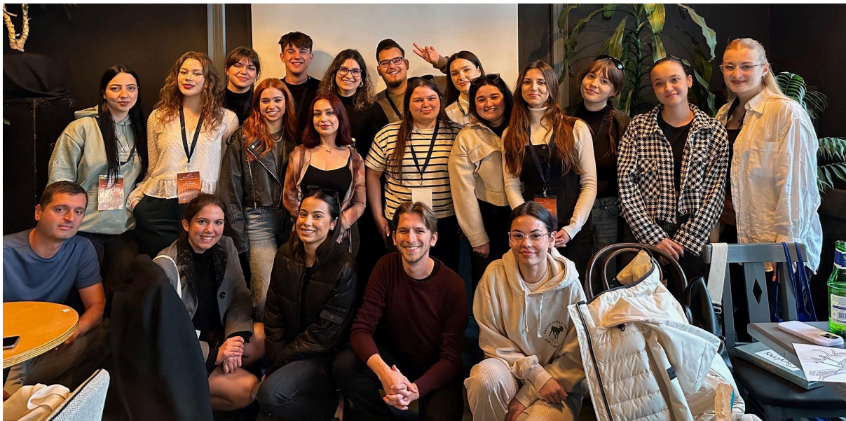
The Organising Committee members of the 1st European Regional Round with Representatives of ELSA International and Panellists

Written by the Organising Committee of the 1 st European Regional Round in Cluj-Napoca, Romania