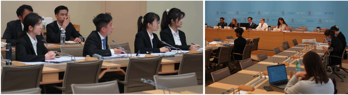
On the pictures: Quarter-Final Pleadings - participating Teams and Panellists.

After the Semi-Finals and the calculation of scores, the Teams, Panellists joined together to spectate the announcement of the Grand Finalists.